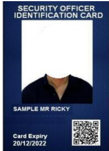
New ID Card with QR code